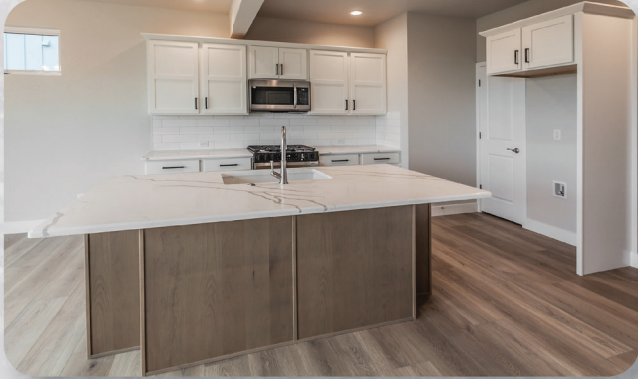
*Images Of Previously Built Home

Front Yard Landscaping & Rear Yard Fence Included (per plan, ask rep for details)